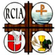
Rite of Christian Initiation for Adults