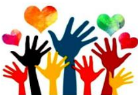
God's Work - Our Hands